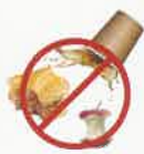
FOOD WASTE/LIQUIDS DON'T BELONG