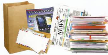
Junk Mail, Periodicals, & Office Paper (Paper bags, envelopes, & catalogs)