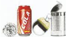
Aluminum & Steel Cans (Foil & empty food & beverage cans)