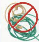
TANGLERS DON'T BELONG