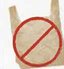
PLASTIC BAGS DON'T BELONG

THE ITEMS LISTED BELOW DON'T BELONG IN YOUR RECYCLING BIN.