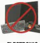
ELECTRONIC WASTE ITEMS DON'T BELONG