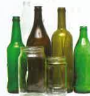
Glass Bottles & Jars (Empty food & beverage bottles & jars)