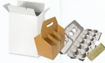
Boxboard (Dry-food boxes, egg cartons, & rolls)