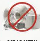
SCRAP METAL ITEMS DON'T BELONG