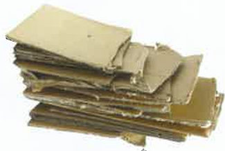
Corrugated Cardboard (Wavy center layer)