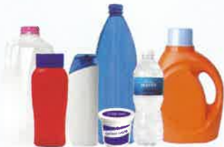
Plastic Bottles, Jugs, Tubs, & Lids (Empty kitchen, laundry, & bath containers)