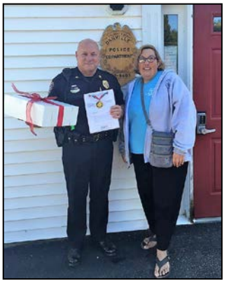
National Law Enforcement Appreciation Week