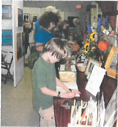
250 th – Art Show