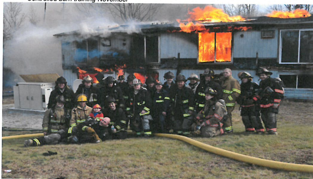
Controlled burn training-November