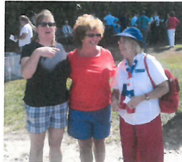
250 th – Enjoying the day