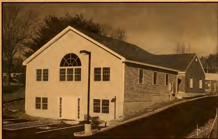
COLBY MEMORIAL LIBRARY, 2003 ADDITION